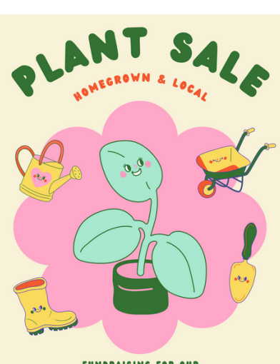
FUNDRAISING FOR OUR Community Allotment Project 22 March | 3:15 PM Cherry Tree School Playground

Please do come along, support the school and pick up a locally grown bargain.