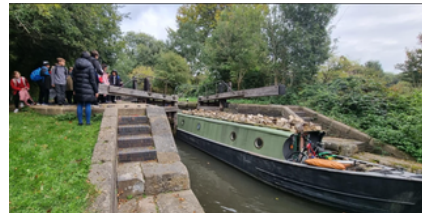
The Year 6 Team

We enjoyed a wonderful visit to the Grand Union Canal in Watford exploring our local area, observing canal usage and putting our strength to the test by opening and closing locks for passing narrowboats.